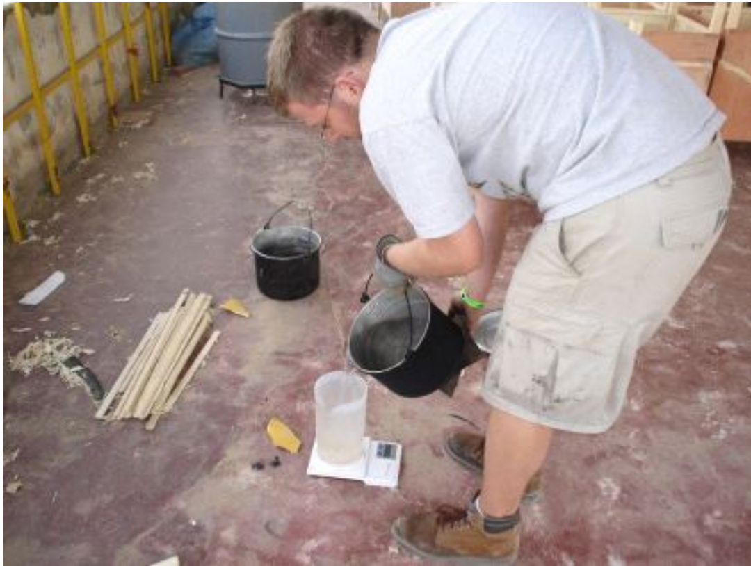
(Above and below) Now that's two guys hard at work!!