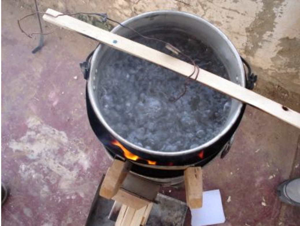
A rolling boil will start somewhere between 91-91.5°C. Temperatures have been as high as 91.9°C, which seems to be the highest temperature we can reach at our altitude.