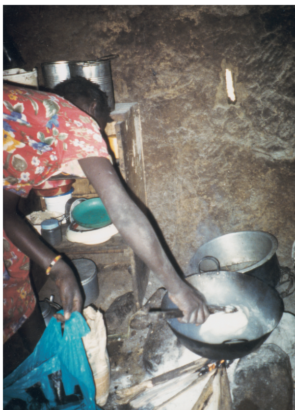
Figure 1: High exposure to pollution during cooking

Furthermore, exposure to emissions varied with between-day variation in: moisture content or density of fuel; air flow; type of food cooked; and choice of stove and fuel if the household used more than one stove or fuel. Activity patterns can also vary with seasonal changes in work and school, illness, market days, &c. Hence, we based our exposure calculations on measurements from more than 1 day. We assigned households to pollution concentration categories for calculation of m , m_{<95} , and m_{>75} for burning and smouldering periods. We also grouped time budgets