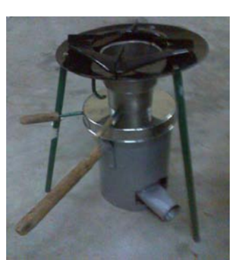
Champion – 2008 to Present