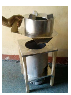
Quad - 2012 to Present