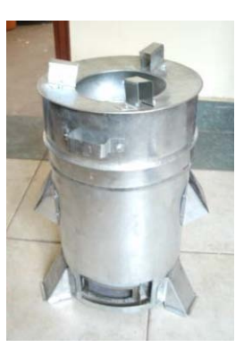
Mwoto – 2010 to Present