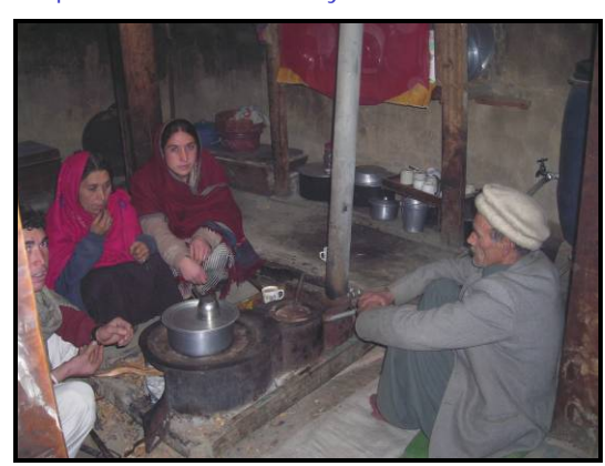
BACIP model home with water warming facility (note blue tank in upper right and pipe inlet to stove).

BACIP's water warming facility, one of its best selling products, also reduces smoke inside rural houses and decreases women's drudgery. By running pipes through the household woodstoves, this product simultaneously heats water while