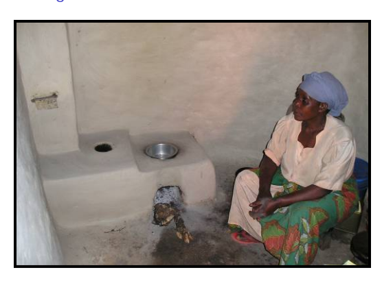
Low-cost improved firewood stove appropriate for rural households

In addition to the IAP reduction benefits, the improved stoves reduce wood consumption by more than 50% thereby reducing drudgery on women and children in searching for firewood. On the average in Tanzania, a household with improved stove consume about 1,700 kg of wood per year, in contrast to 2,900 kg/year with traditional wood stoves; for households using charcoal, annual use is 370 kg, compared to 1,080kg with traditional metal charcoal stoves.