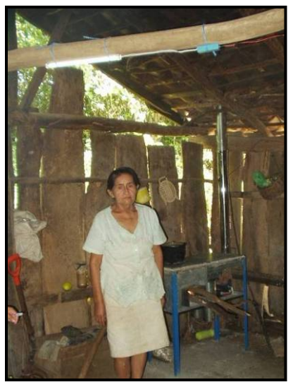
A rural women in Nicaragua with her Firefly-Ecostove generating cooking heat and electricity.

Winrock International and its partners Colorado State University (CSU) and Proleña /Nicaragua began last October the first field testing of the Firefly Ecostove, the first woodstove to be designed for both cooking and electricity generation for developing countries. The Firefly Ecostove uses a thermoelectric generator, which absorbs excess heat from the Ecostove combustion chamber (powered by a "rocket" stove), and generates about 18 watts of electricity. The four families who are testing the Firefly Ecostoves are using it for their daily cooking on a clean and efficient stove, while in the evenings lighting a 9 Watt compact fluorescent lamp and also powering a black-andwhite TV.