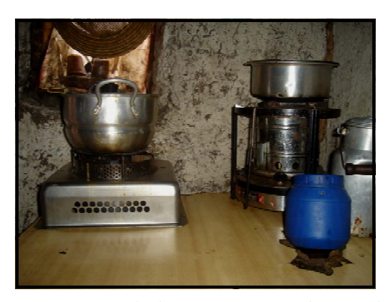
CleanCook Stove (left) and kerosene stove (back right)

The workshop resulted in an increase in the Partners' understanding of commercial considerations and tools available to help them scale up their stove programs. At the end of the workshop, ten organizations presented action plans that they will undertake in the short and long term to improve the commercial aspects of their program.