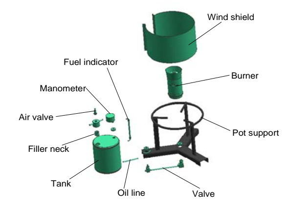
Components of tank and support

The fuel is filled into the tank. With the use of a pump, air is introduced into the tank through the air valve increasing the pressure which is measured by the manometer. The fuel indicator allows monitoring of the fuel level in the tank.