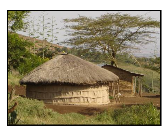
Typical houses from rural poor in Tanzania

These sources and many others have made TaTEDO aware of the need to enable people—especially the poor in the rural areas—to understand the effects associated with uncontained burning of biomass and kerosene and find ways of mitigating such effects. In many rural areas house ventilation is very poor; some houses have no windows and the majority lacks specific kitchen rooms (Msafiri and Pamela, 2005).