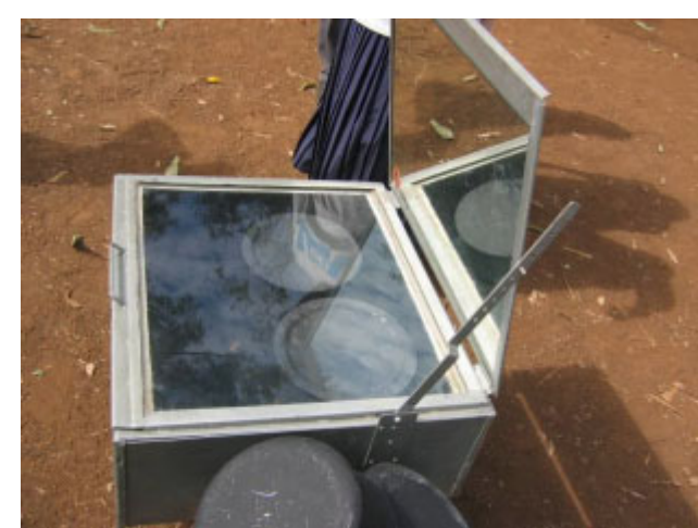
Figure 2: A solar hot box in Kenya

The main disadvantages of hot boxes are their inability to reach higher temperatures and the length of cooking times. Only certain types of meal can be prepared and preparation must be done several hours before mealtime. On the other hand, there is little risk of burning food and so little attention is required, and many dishes, such as curries, sauces and soups, actually benefit from lengthy cooking.