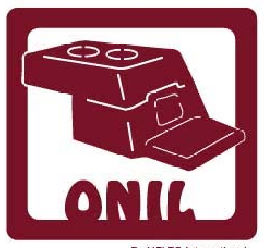
By HELPS International