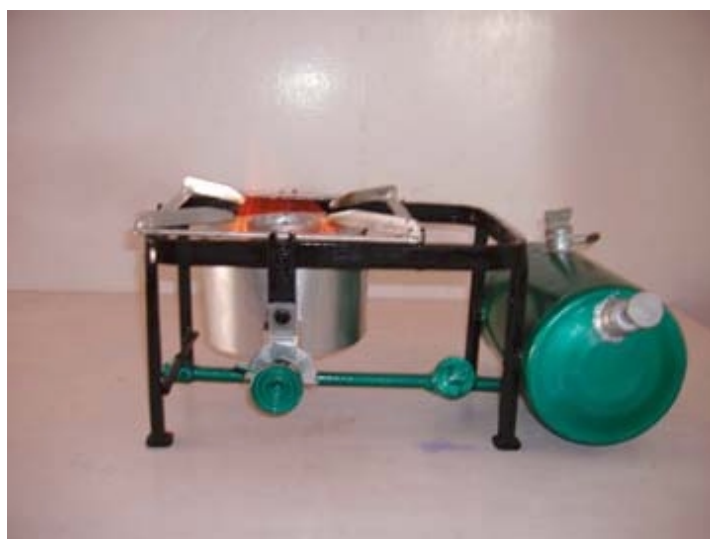
Fig. 2. Ethanol Stove