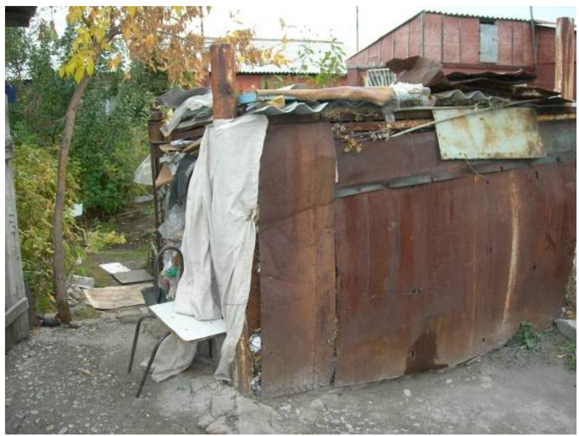
This is her heating supply for the winter.