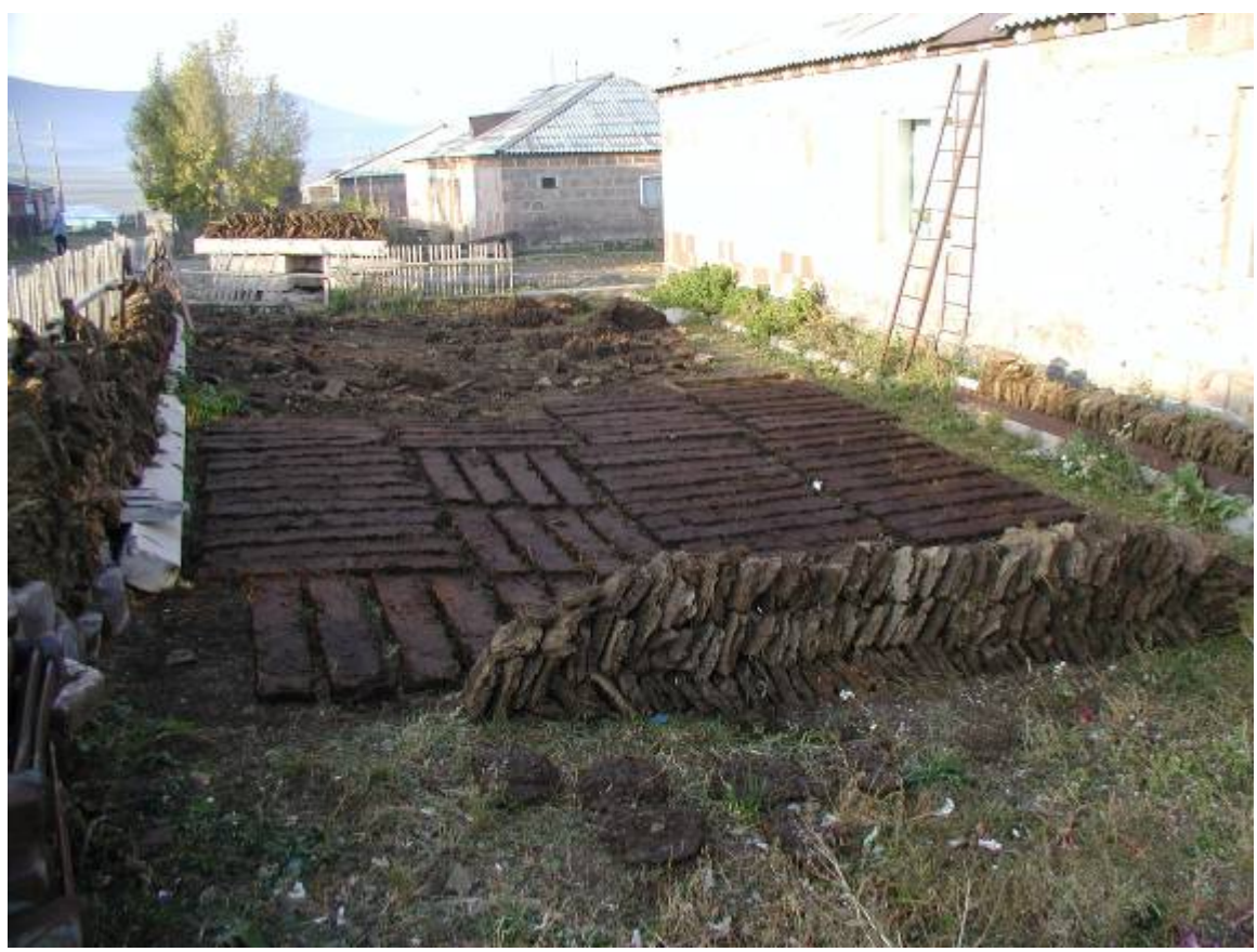
Manure has been spread out to congeal and then cut and stacked to dry.