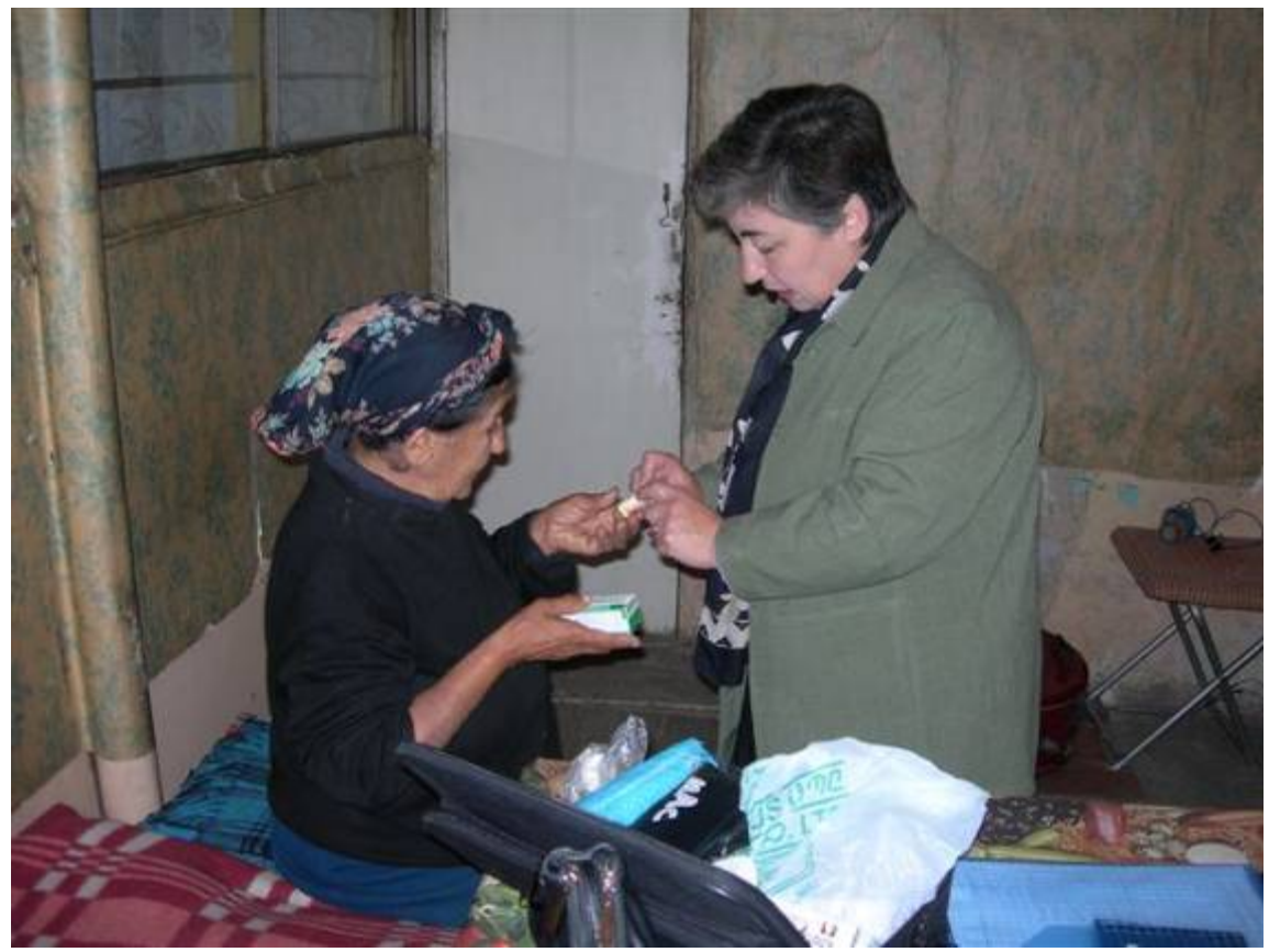
We have come with a social worker from Caritas to visit this widowed "80" year old woman. She has no income and no resources. Caritas helps about 100 women like her but they estimate that there are about 5,000 elderly single women and many others in Gyumri who do not receive anything.