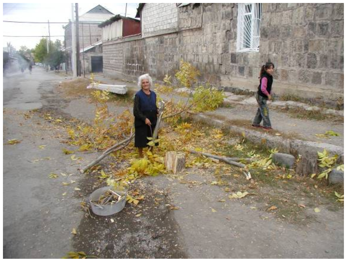
Any available piece of fuel is cut up and saved.