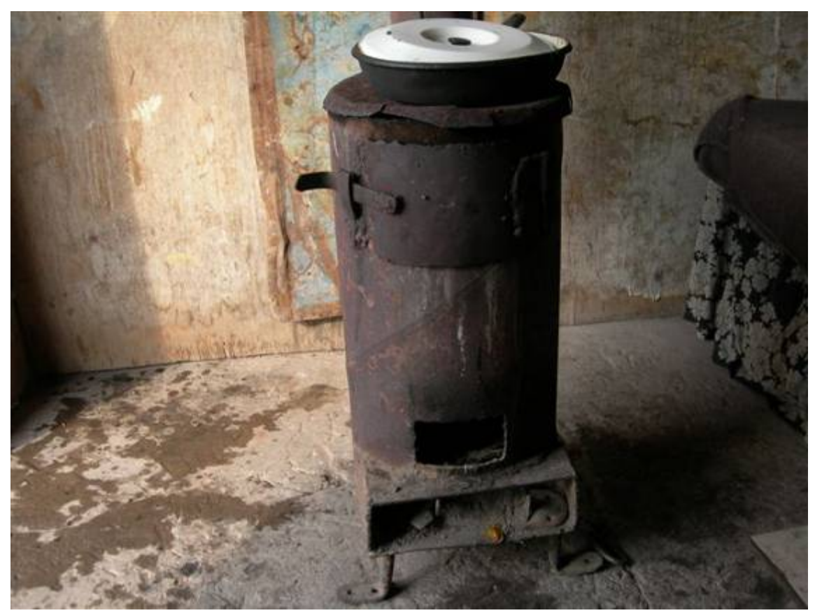
This is her stove.