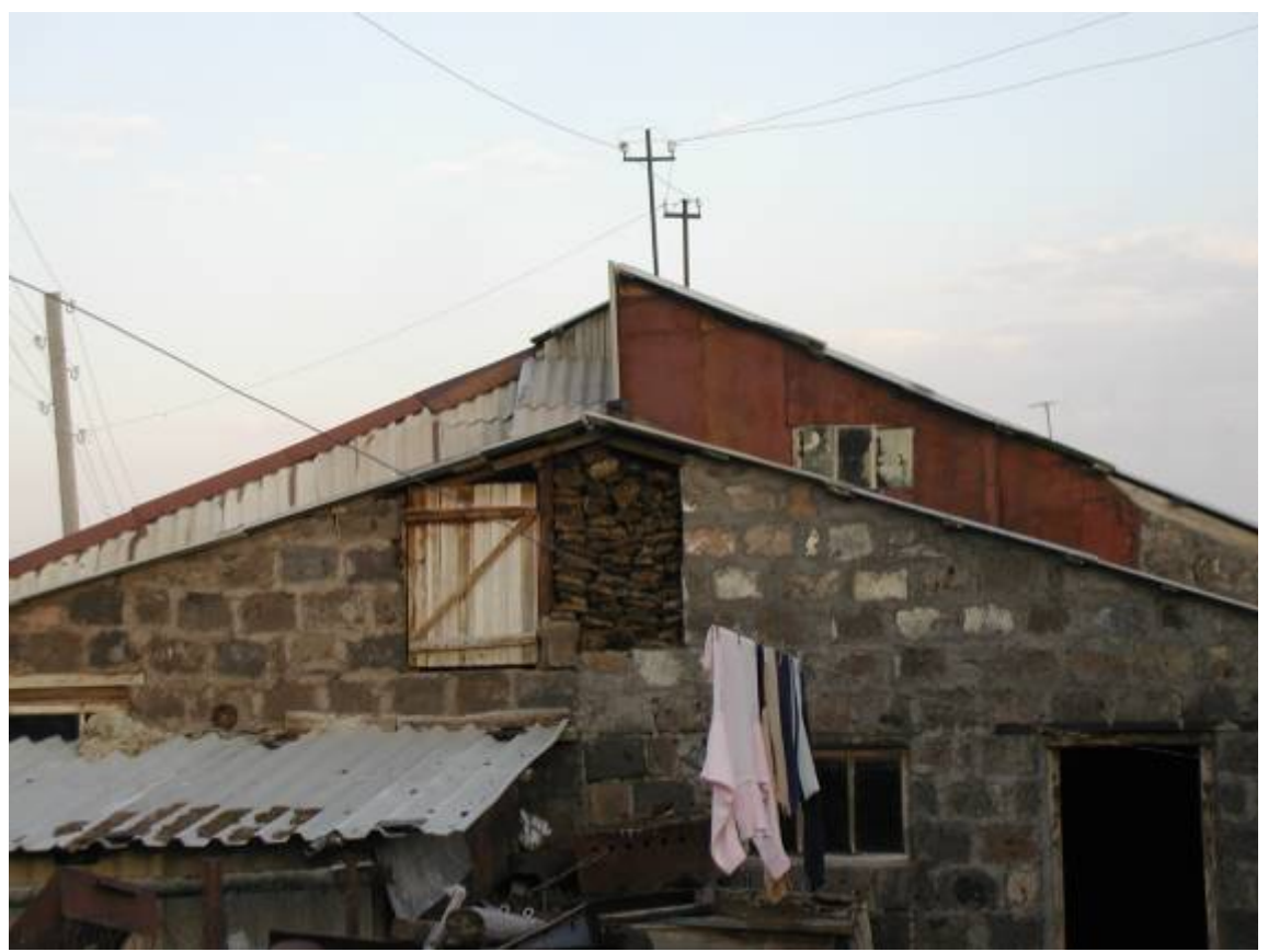
Manure being stored in the attic also serves as insulation.