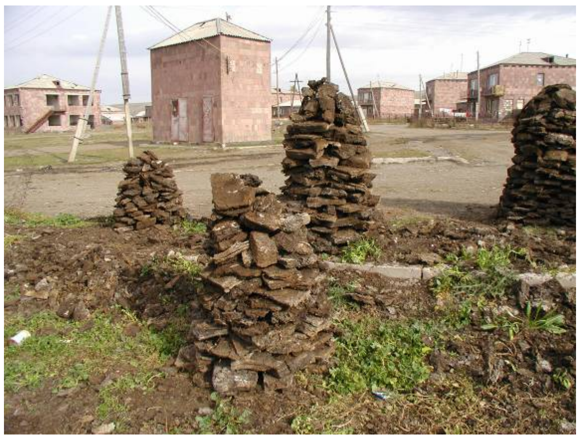
Manure is the main source of heating in the wintertime, when it is not uncommon for the temperature to get down to minus 200 C.