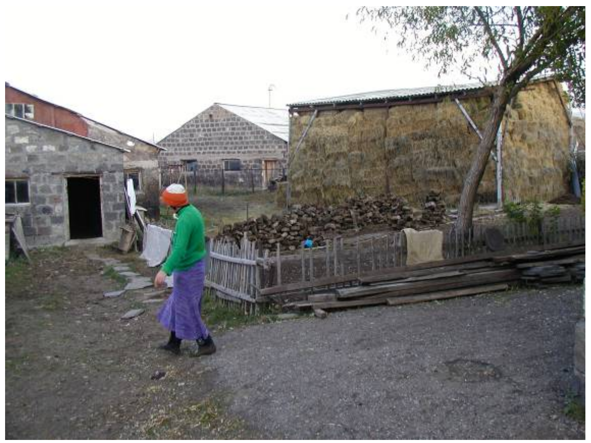
More manure being dried. I'm not sure where it will all be stored. I would think (just guessing) that one would need five or ten tons of it to get through the winter.