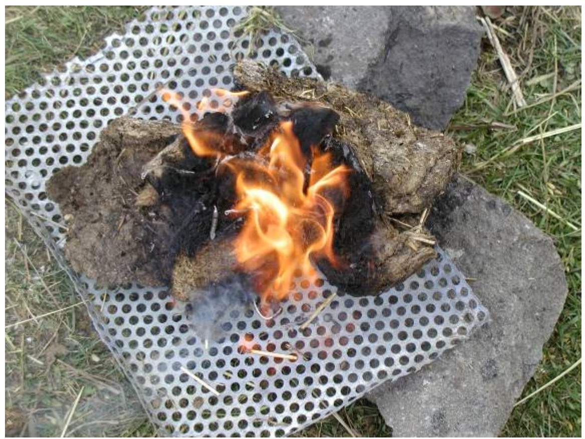
Back at the farm. Manure burns surprisingly good. I expected it to smolder without a very good flame.