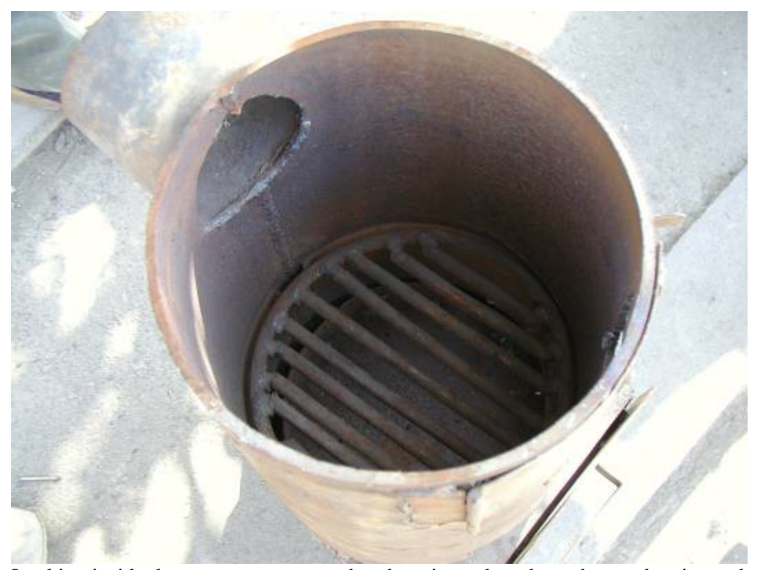
Looking inside the stove you can see that there is no thought to the combustion or heat transfer other than the grate.