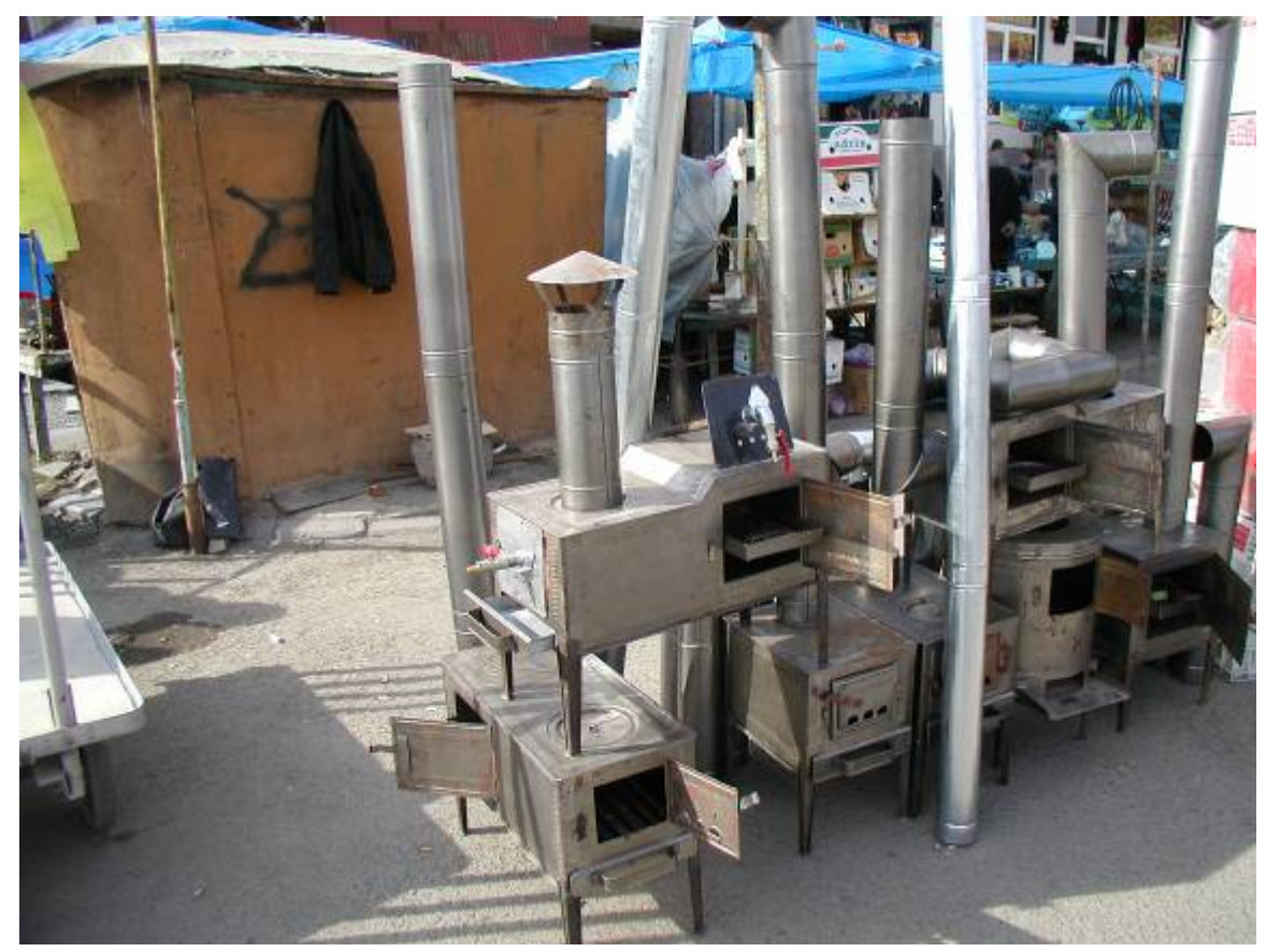
More stoves for sale.