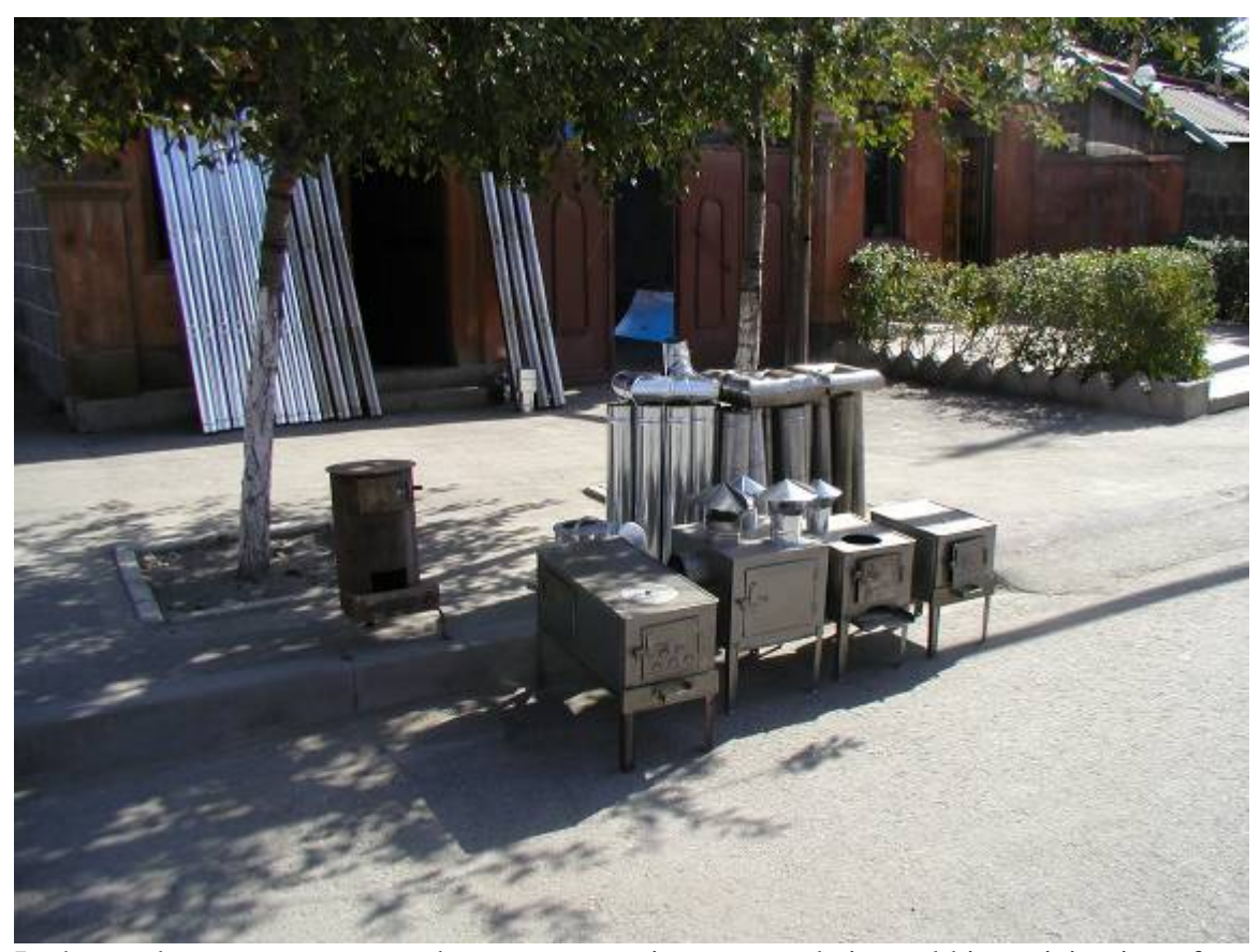
In the market, many stoves and stove accessories are now being sold in anticipation of winter. These sheet metal stoves cost about $15 and you need about $15 more for the chimney.