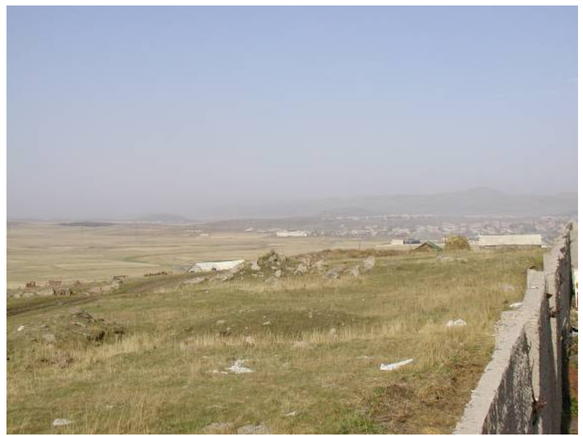
The landscape here is very bleak. No trees. I'm not sure why. Probably they have been cut down over the last couple of thousand or so years and not replanted. The elevation here is 2050 meters.