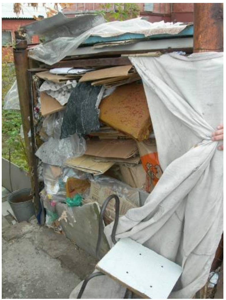
A closer look. Cardboard and plastic she has scrounged from the trash, old shoes burn good, used oil filters. Someone higher up probably gets the waste oil to burn.