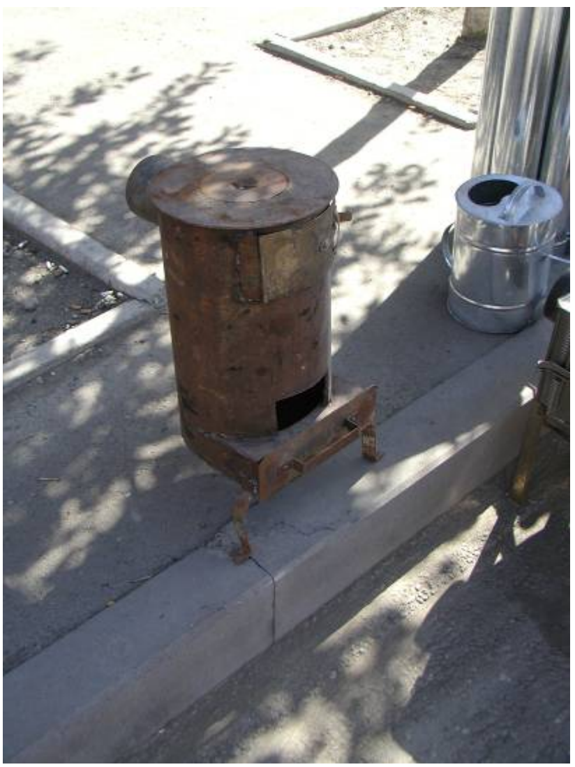
This stove also costs about $15. It has been made from recycled scrap metal. The heavy metal top has a ring to remove so you can heat a pot directly.