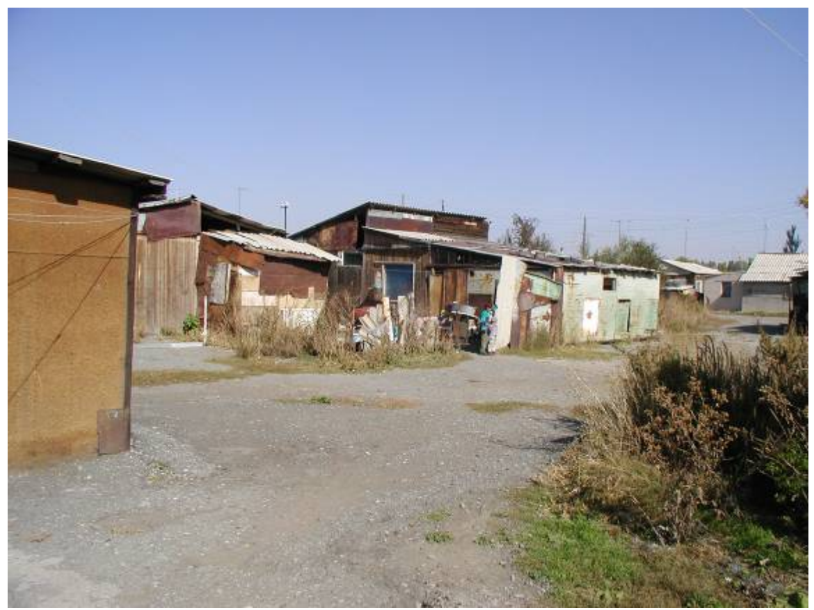
But many people live in houses like this. Some are left over "container" houses called domics, or "little houses", brought in by the Soviets after the earthquake. Others are just shanties.