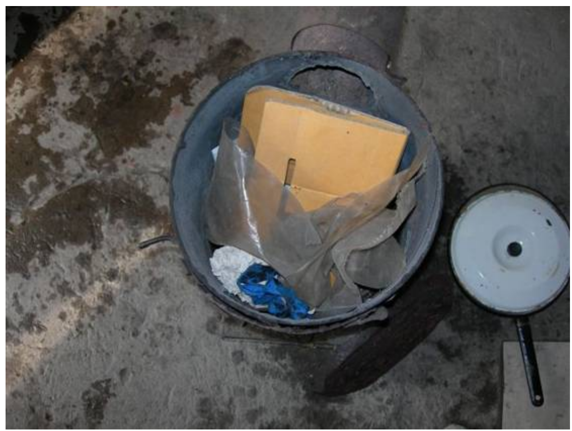
Looking inside, we see contents of her stove, cardboard and plastic.