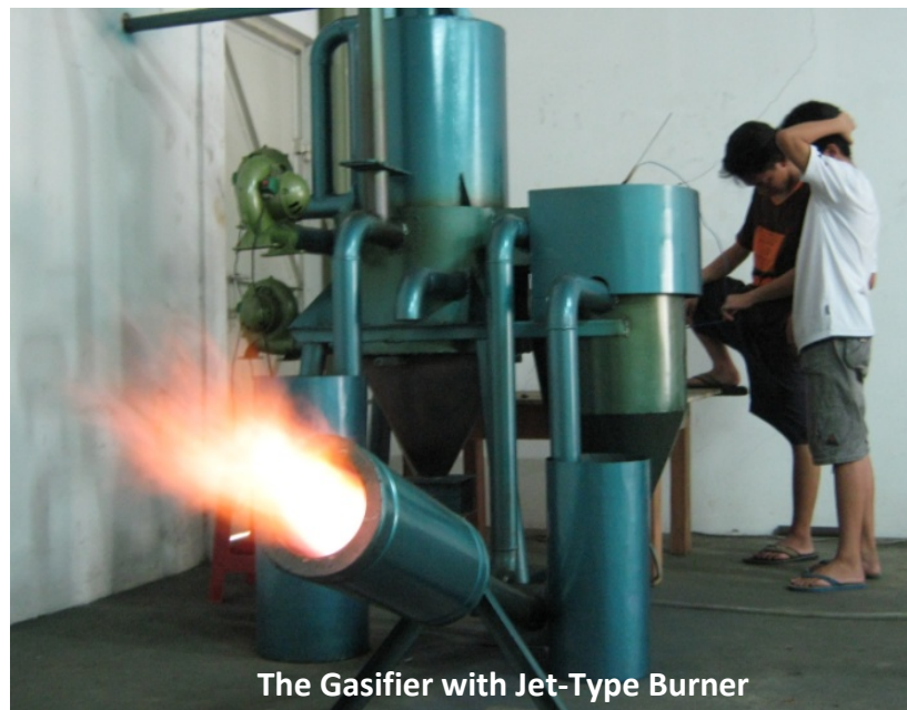
The Gasifier with Jet-Type Burner

In September 2008, the PT Minang Jordanindo Approtech designed and developed a coal gasifier to serve as alternative to conventional burners using LPG, kerosene, and diesel fuel burners. By gasification process, coal can be conveniently burned with almost no smoke and no sulfur odor at all. Combustible gases generated from the reactor can be piped-in to a burner for heating stoves, mechanical dryers, kilns, and even boilers.