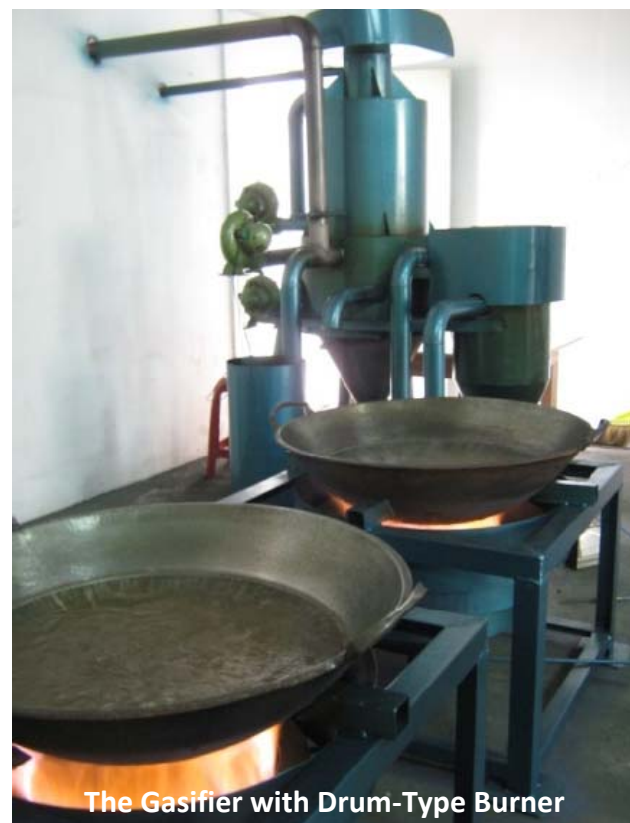
The Gasifier with Drum-Type Burner