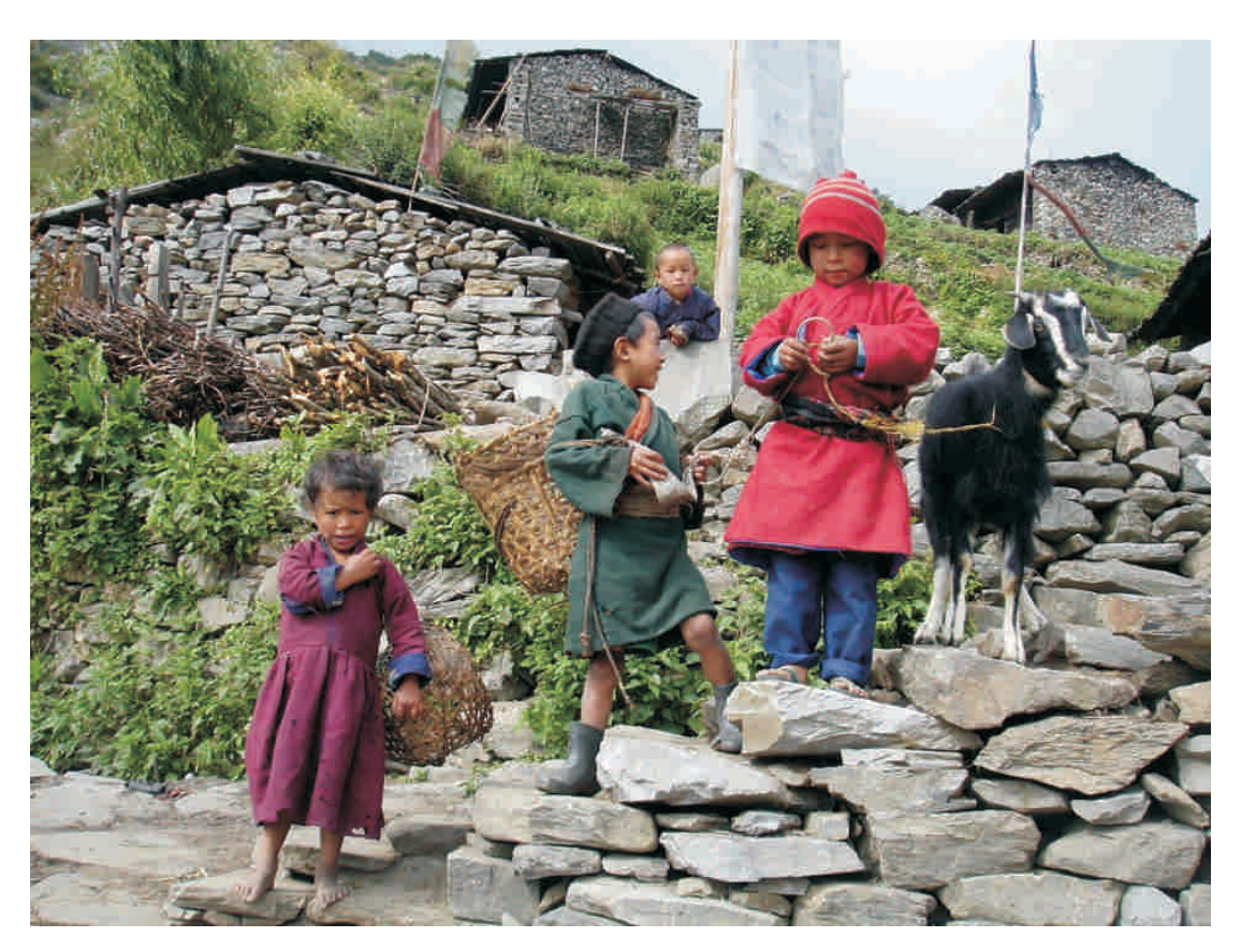
"Daily Routine: Its time to work, No time for School"