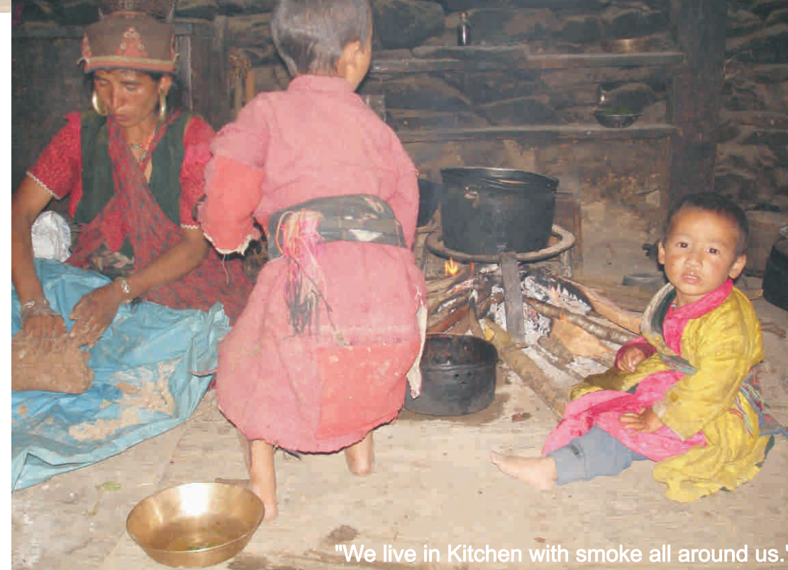
<u>Smoky Days and Cold Nights</u> <u>What Should I do for my Childrens' Rights</u>

Lets join hands HELP them. Lets kill the killer smoke.